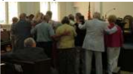
Council blessing the leadership team and the future of CWM.

The worship service ended in a powerful display of unity in Christ as the CWM council surrounded the team at the altar to cover them with prayer and blessing. It was an amazing day of celebrating all that God has done and a proclamation of what He has yet to do through CWM.