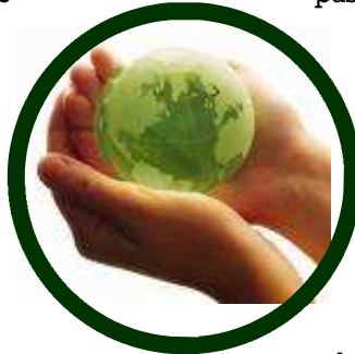
Making the Most of every opportunity to share God's love in the world.

The team of leaders we have assembled for this year's Holy Spirit Conference have rich experience to share. As local church pastors, international evangelists,